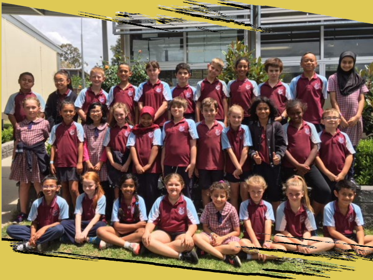
Rosemeadow Public School, Year 3/4 2017